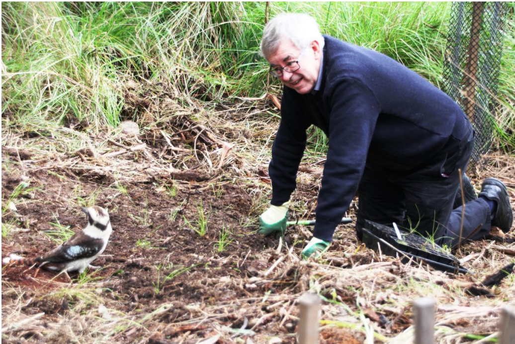
Planting grasses increases the quality of natural habitat and ... attracts local wildlife